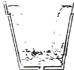
Cross Section of Doug's Potting Method